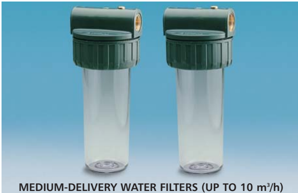
MEDIUM-DELIVERY WATER FILTERS (UP TO 10 m 3 /h)