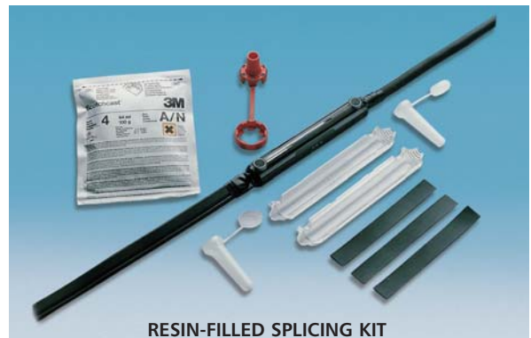
RESIN-FILLED SPLICING KIT