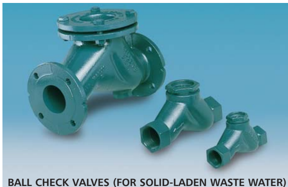
BALL CHECK VALVES (FOR SOLID-LADEN WASTE WATER)