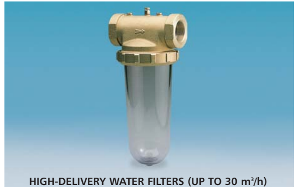
HIGH-DELIVERY WATER FILTERS (UP TO 30 m 3 /h)