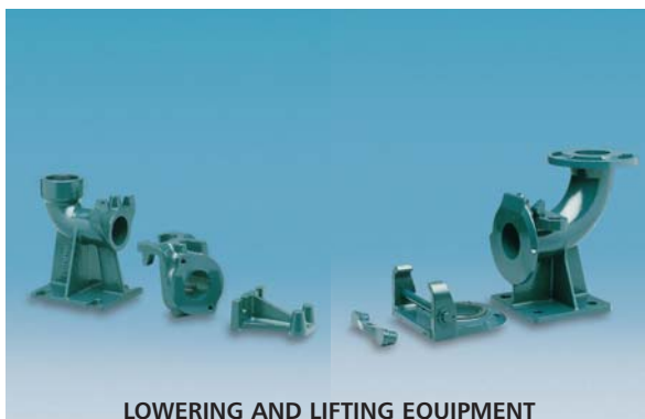
LOWERING AND LIFTING EQUIPMENT