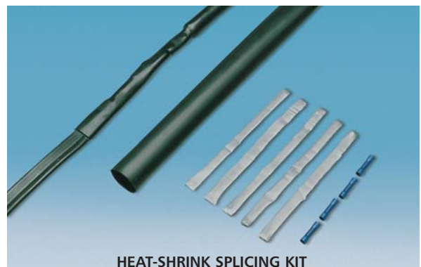
HEAT-SHRINK SPLICING KIT