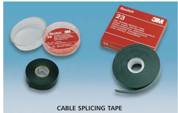
CABLE SPLICING TAPE